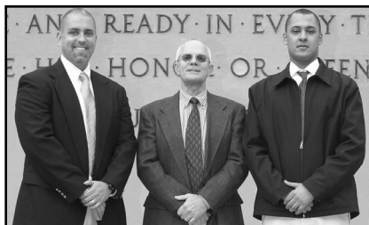
The VMI Coaching Staff